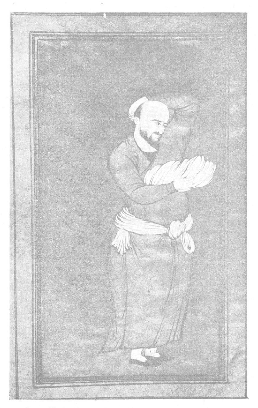
Picture No. 1,-Man scratching his head, dated 1007 A.H. Signed as Riza.